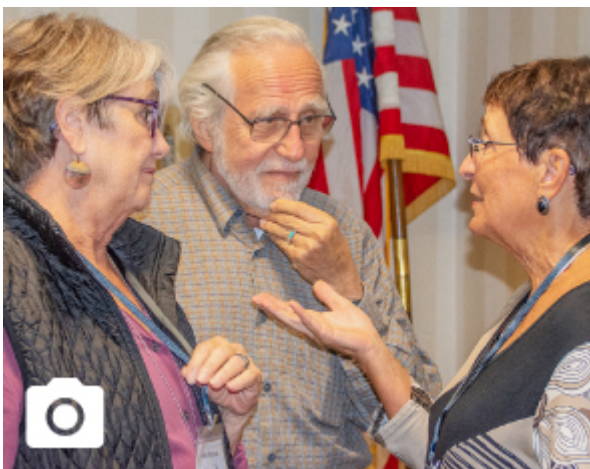
Medical alumni in the <u>US</u> were updated on Wits developments at a reunion in Newport, Rhode Island, in September 2018.

The Mechanical Engineering Class of 1968 met for their 50th graduation anniversary last year. Your contact for class reunions is Purvi Purohit: purvi.purohit@wits.ac.za.