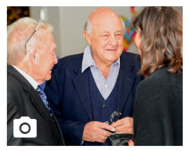
The Health Graduates Association held its annual Alumni Week in September 2018.