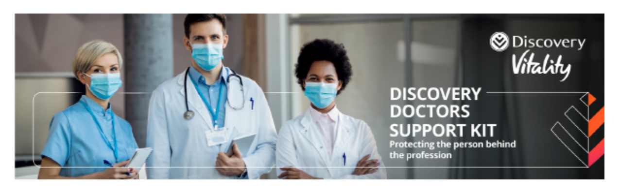
ADVERTORIAL: Discovery is offering a special support kit to medical graduates. See more <u>here</u>.